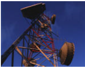
Spreading the science message far and wide

Following much deliberation, Euroscience – an association of science stakeholders – has announced the scientific themes for its 2004 Open Forum, from which many parallels can be drawn with the research priorities under FP6.